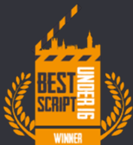
Best Original Film Script Under 16