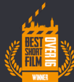
Best Short Film 16 and Over