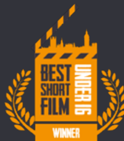
Best Short Film Under 16