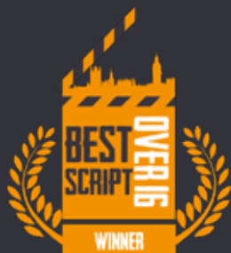
Best Original Film Script 16 and Over